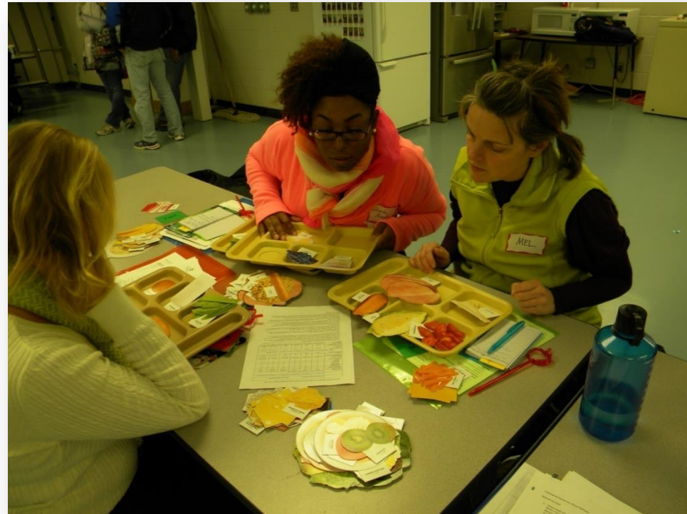
Parents in “Empowered Parents for School Wellness” workshop learn how much and what types of foods are included in a reimbursable meal