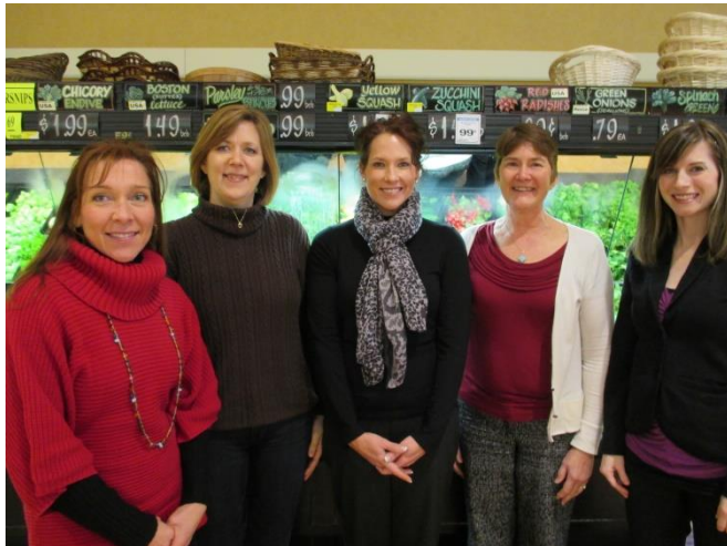
Meet the Challenge! RDNs